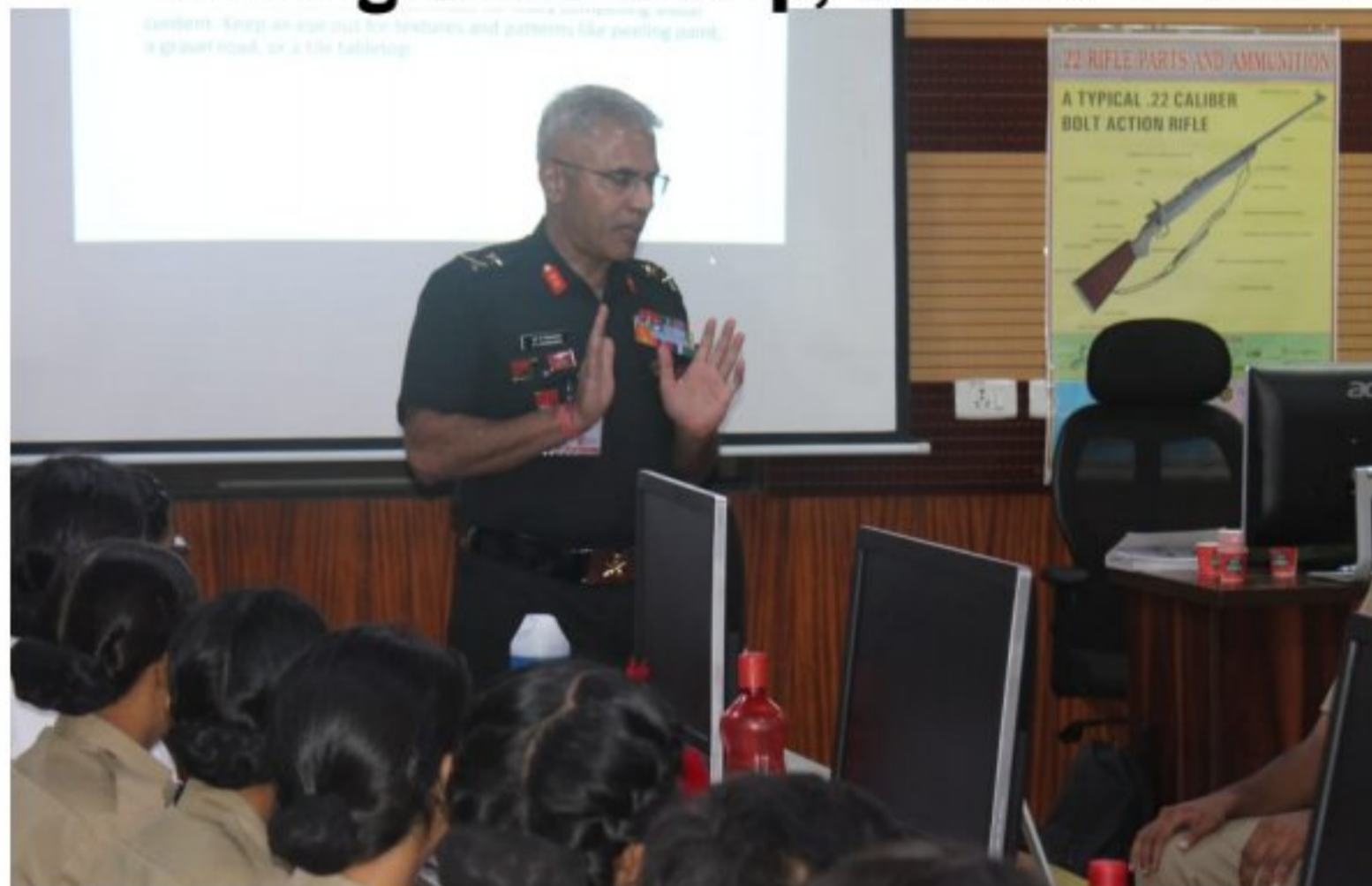
Address by ADG to Cadets at NCC Bhawan, Rohini.