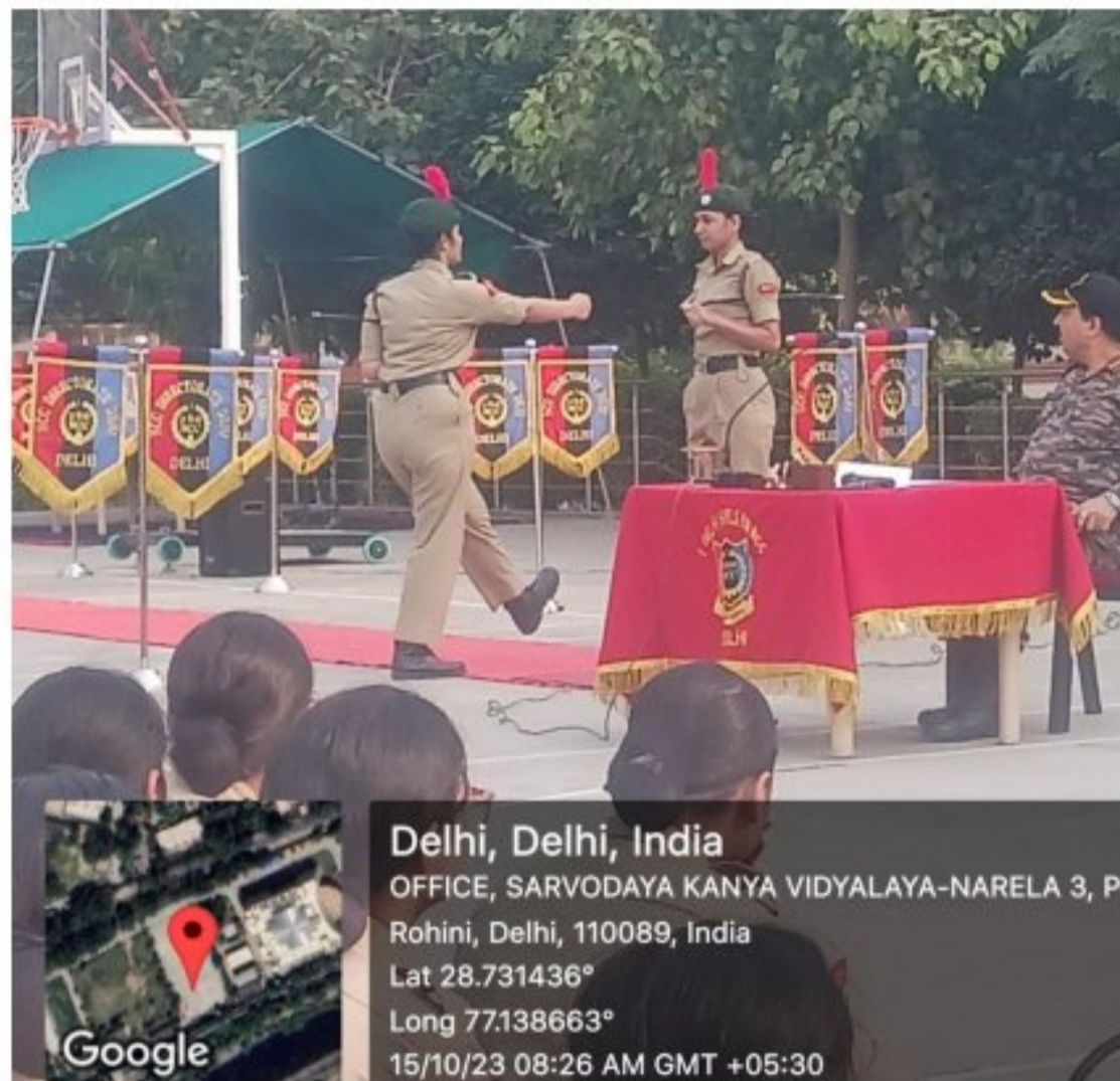
Guard of Honour