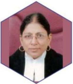
Justice Manju Goel former judge Delhi High Court