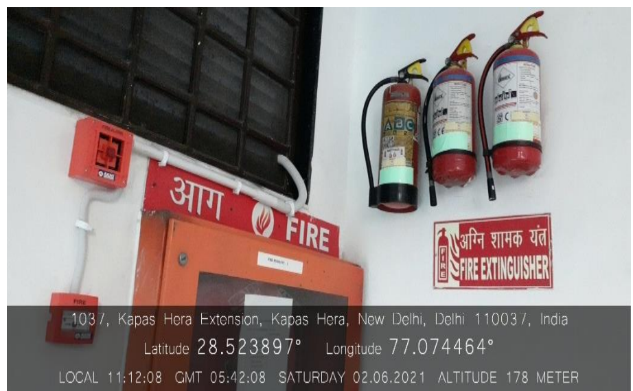
Fire extinguishers available in whole campus