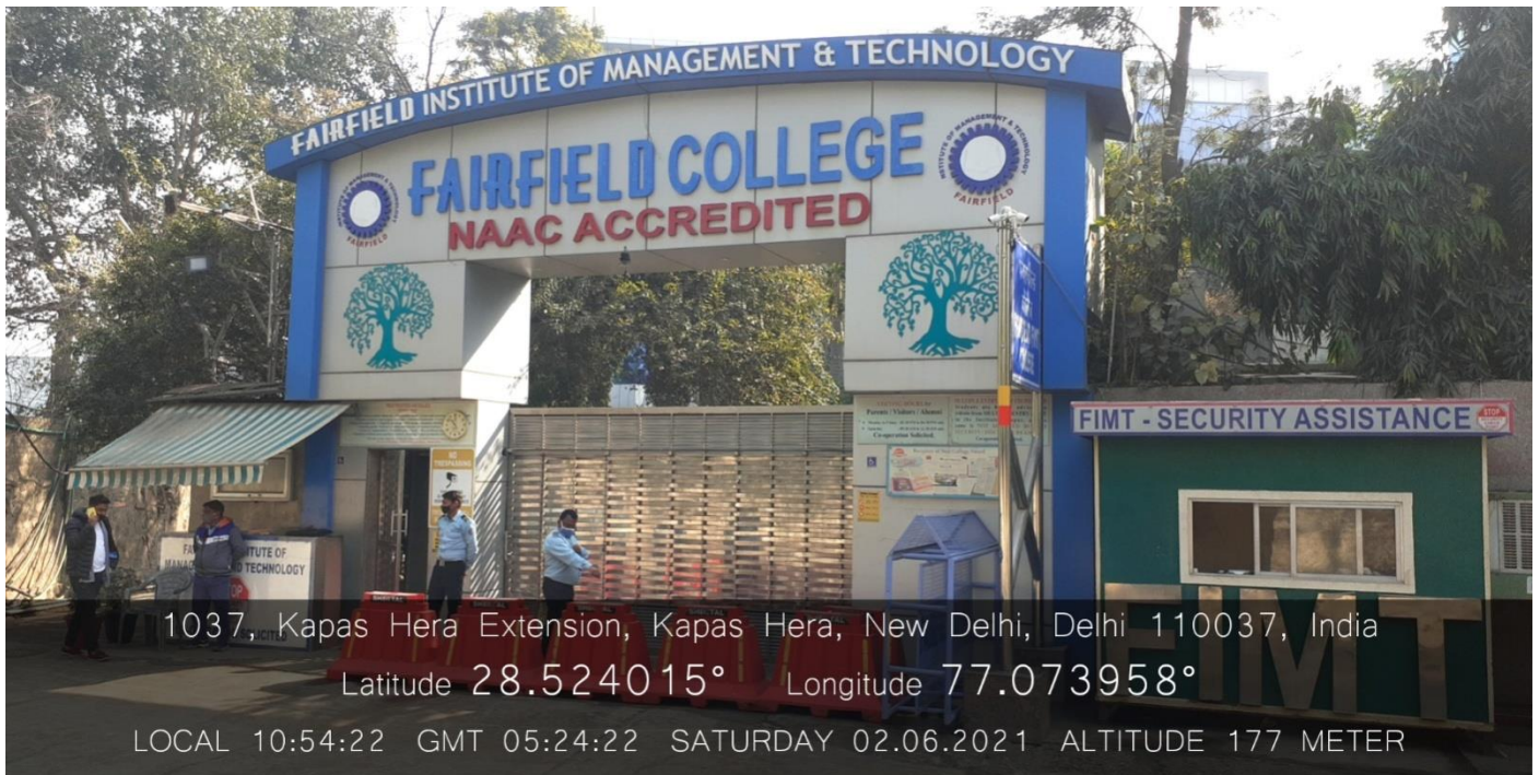
FIMT SECURITY CHECK POINT