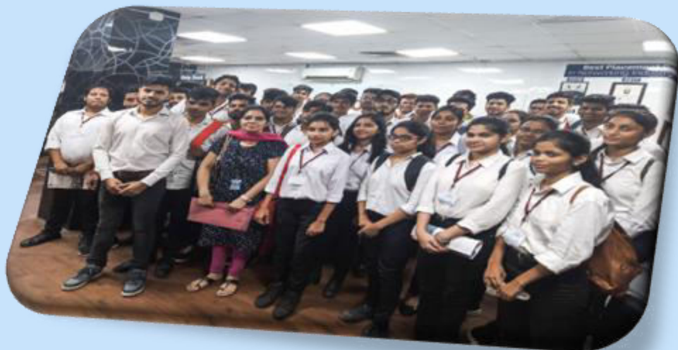
INDUSTRIAL VISIT AT NETWORK BULLS