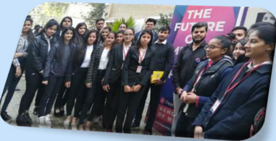
VISIT TO PEARL ACADEMY