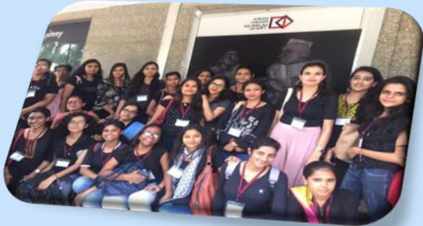
B.ED. STUDENTS VISIT TO KIRAN NADAR MUSEUM OF ARTS